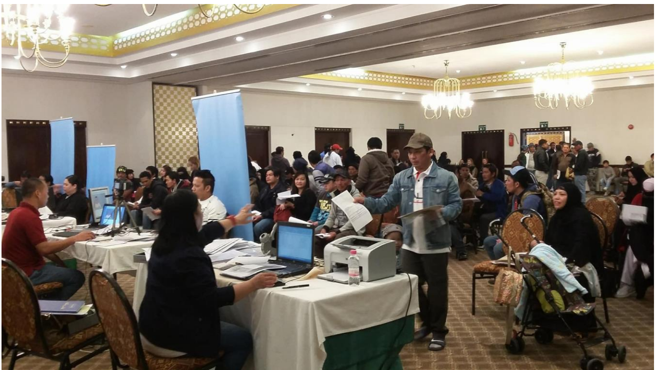
Passport renewal and Notarial applicants during the EOW

(Riyadh, 07 January 2018) – The Philippine Embassy in Riyadh successfully held its 1st consular outreach mission or “Embassy on Wheels” (EOW) in 2018 at the Al Nusi Hotel in Sakaka, Al Jouf on 05-06 January 2018.