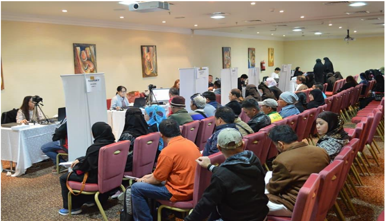
Passport renewal applicants during the EOW

(Riyadh, 21 January 2018) – The Philippine Embassy in Riyadh successfully held its 2nd consular outreach mission or “Embassy on Wheels” (EOW) in 2018 at the Golden Tulip Hotel in Buraidah on 19-20 January 2018.