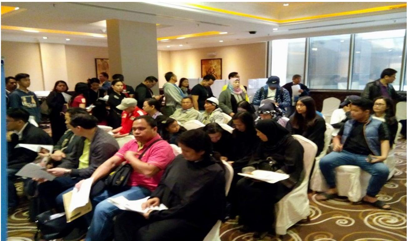
Passport renewal applicants during the EOW

(Riyadh, 29 January 2018) – The Philippine Embassy in Riyadh successfully held its 2 nd consular outreach mission or “Embassy on Wheels” (EOW) in 2018 at the Double Tree Hotel in Dhahran on 26-27 January 2018.