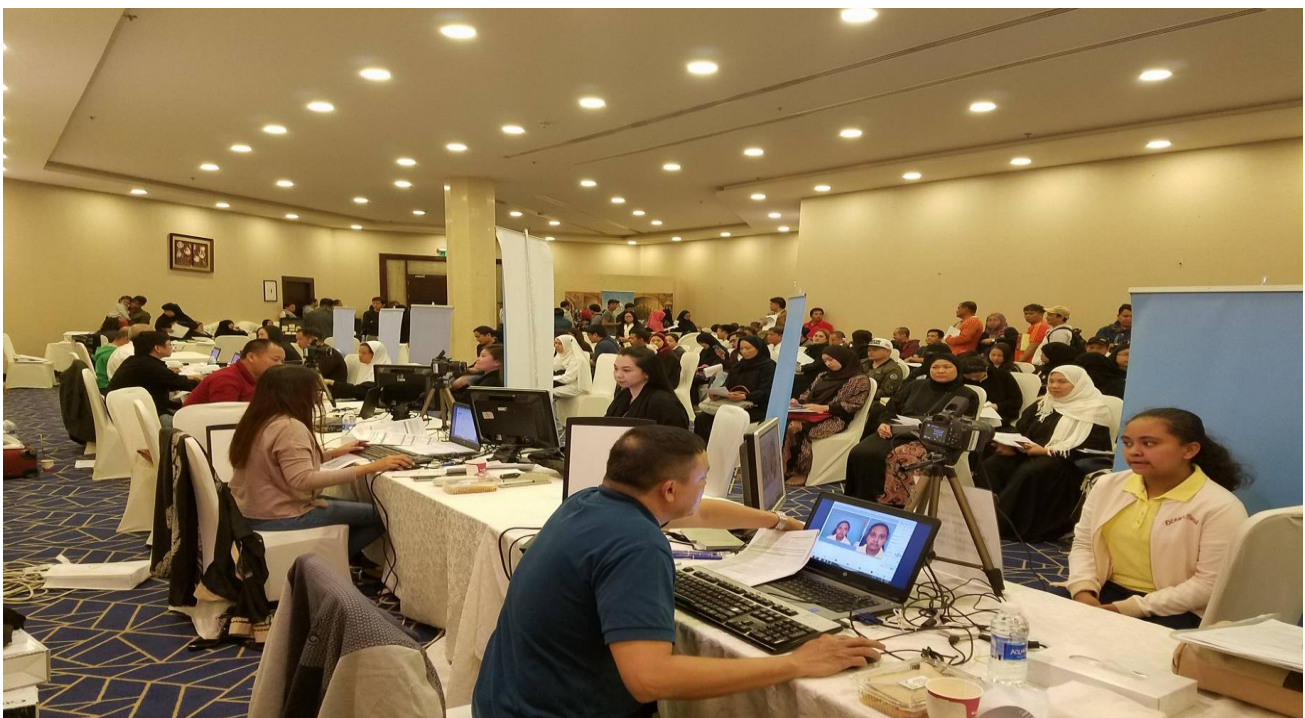
Passport renewal applicants during the EOW

(Riyadh, 13 February 2018) – The Philippine Embassy in Riyadh successfully held its 5th consular outreach mission or “Embassy on Wheels” (EOW) in 2018 at the Golden Tulip Hotel in Hail on 09-10 February 2018.